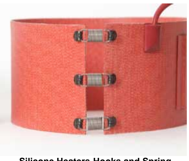
Silicone Heaters-Hooks and Spring