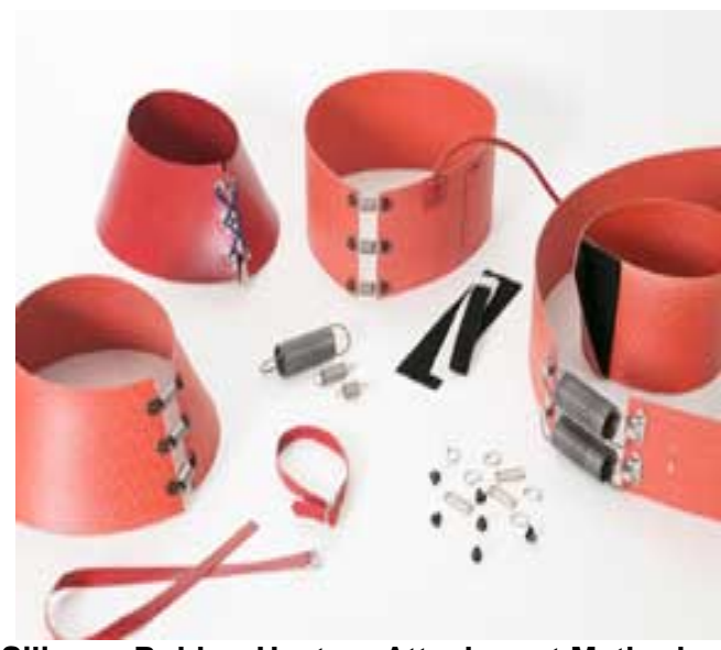
Silicone Rubber Heaters Attachment Methods