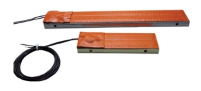
Silicone Rubber Heaters-Factory Vulcanization