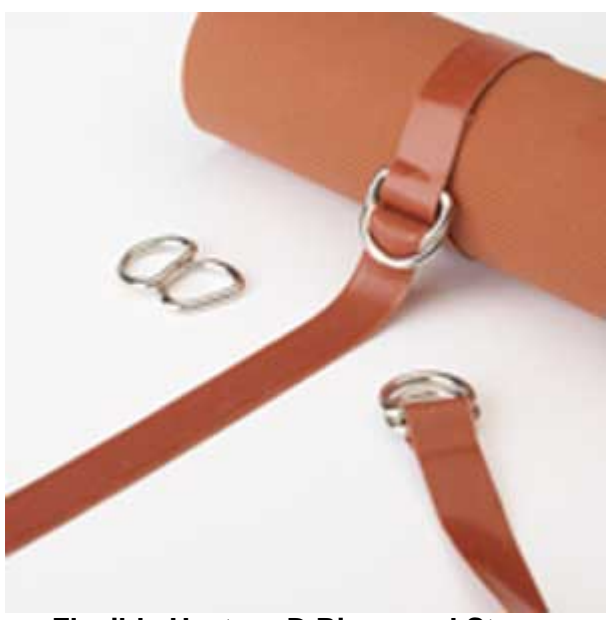
Flexible Heaters-D Rings and Straps