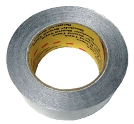
High Temp. Aluminum Tape