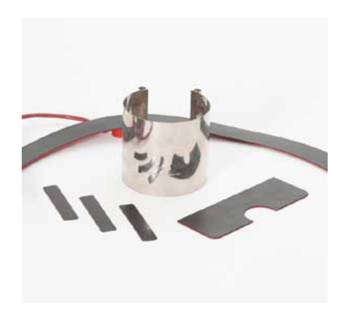
Silicone Flexible Heaters-Magnetic Back