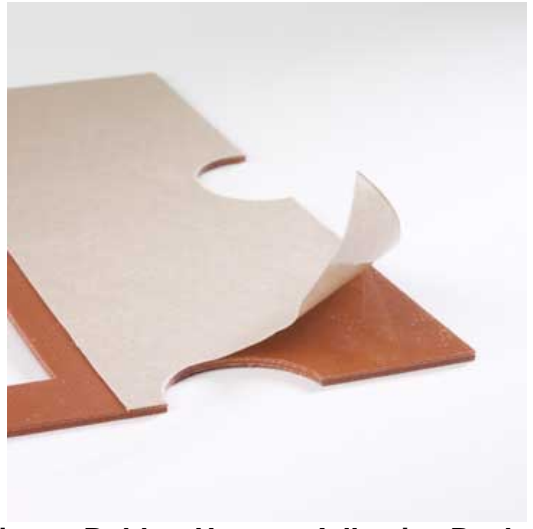
Silicone Rubber Heaters-Adhesive Back