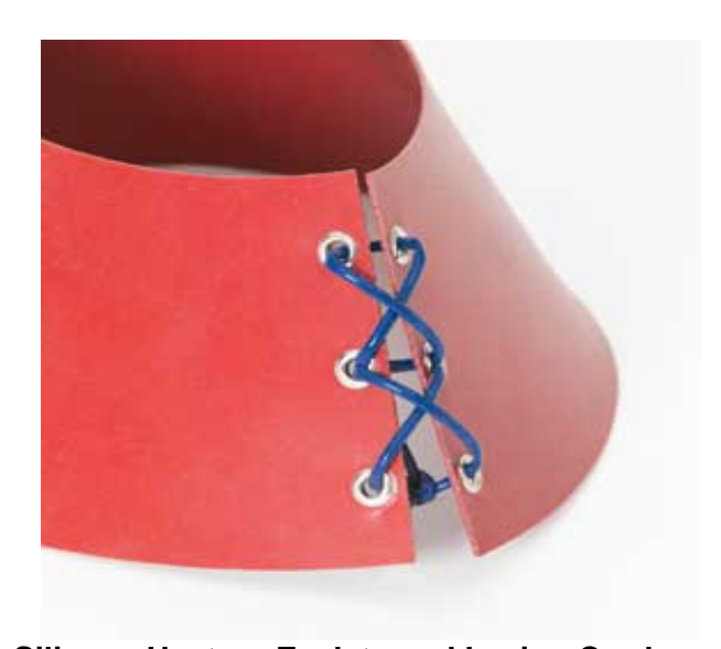
Silicone Heaters-Eyelets and Lacing Cords